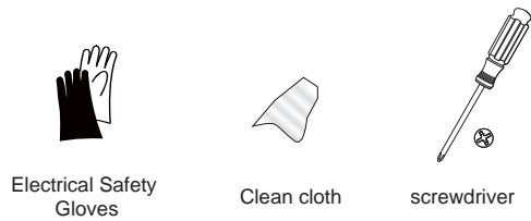
Electrical Safety Gloves